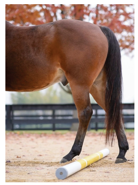
For horses prehabilitating or on stall rest, incorporate pole work during hand-walking to work on proprioception.

In a recently published NCSU study (TheHorse. com/1125183), treatment with this device resulted in significantly enhanced lymphatic flow compared to the control group. For this reason Schnabel views it as an essential tool for horses in the postoperative period to restore lymphatic health and clear the limbs of inflammatory mediators and metabolic waste with the goal of reducing pain and improving healing.