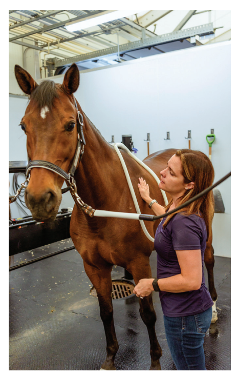
Acclimate horses to any rehab equipment you will be using, such as PEMF therapy, prior to surgery.

"Because of his improved fitness preop, he was able to quickly rebuild his topline