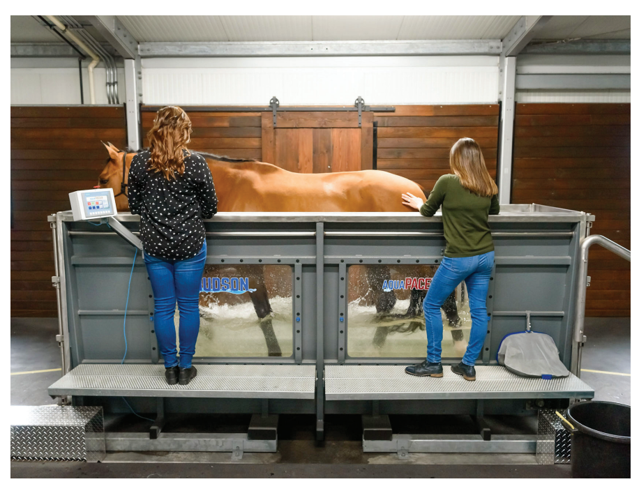
A water treadmill offers low-impact, high-resistance exercise, which can help prehab surgical candidates and is especially beneficial for animals recovering from joint injuries.

"What initially presents as a setback such as a suspensory ligament injury or a